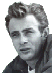
My favorite Heretic