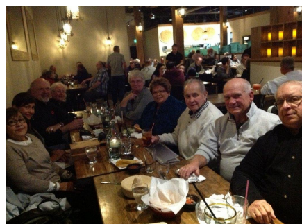
“See, we were all there.”